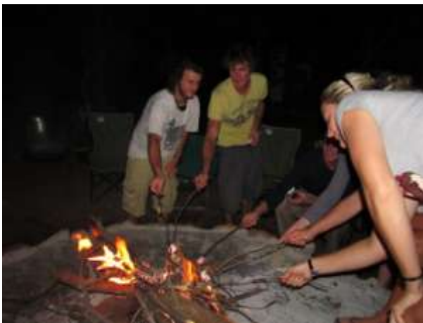
Cooking marshmallows over the fire...