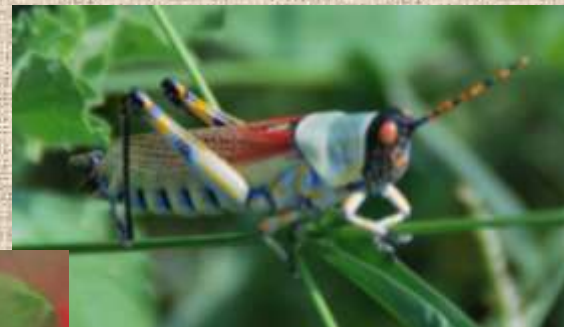
Elegant Grasshopper Zonocerus elegans