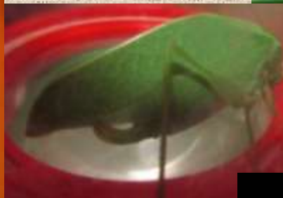
Leaf Katydid Eurycorypha