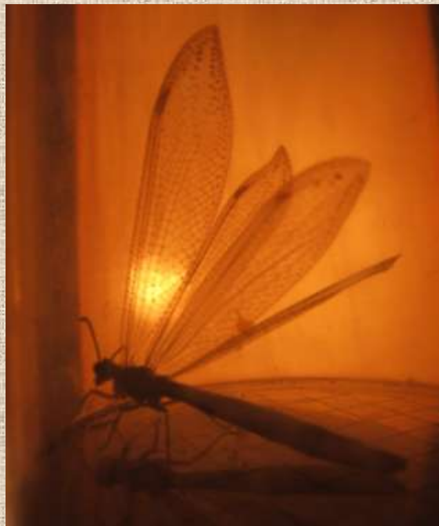
Large Grassland Antlion Creoleon diana

The point is that we should never over look the small things and although insects are small they are “great”. Another fabulous thing about insects is that you don’t have to go far to appreciate them, you can start in your garden and they make the perfect models for beginner photographers. My advice, go take another look!