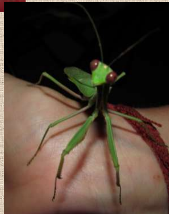
Common Green Mantid Sphodromantis gastrca