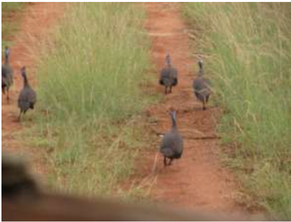
Some brave guinea fowl playing chicken with the land rover...