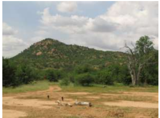
The view of Tswi (highest mountain) from the back of camp...