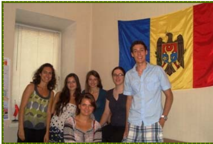
Projects Abroad Moldova staff and volunteers

THE OFFICIAL NEWSLETTERS OF PROJECTS ABROAD MOLDOVA